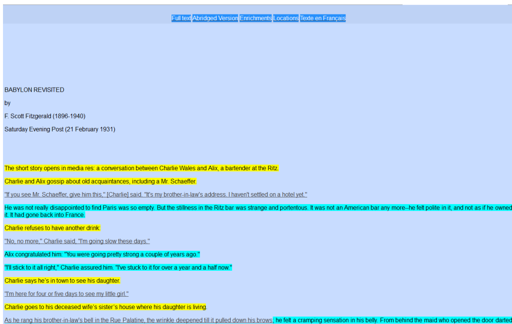
Figure 1 - Color-coded abridged version of the story

The screenshot of our eZB (figure 1), shows the following 5 tabulations: Full text, Abridged Version, Enrichments, Locations, Texte en Français.